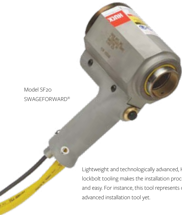
Model SF20 SWAGEFORWARD®

Lightweight and technologically advanced, Huck lockbolt tooling makes the installation process quick and easy. For instance, this tool represents our most advanced installation tool yet.