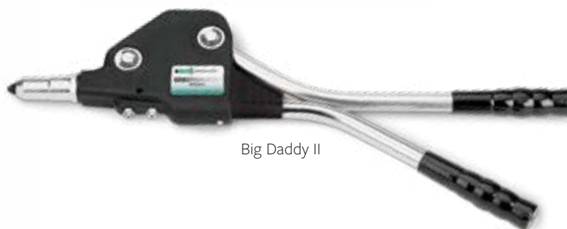
Big Daddy II